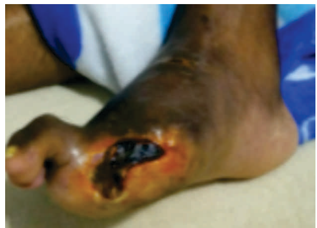
Figure 1. Cavus foot, with claw toes, ulcer at the base of the first metatarsal, with necrosis, edema, perilesional

ECODOPPLER: Mild bilateral atherothrombosis in bilateral femoral and popliteal arteries, severe atherothrombosis with diffuse lesions in infrapopliteal arteries between 50-75%.