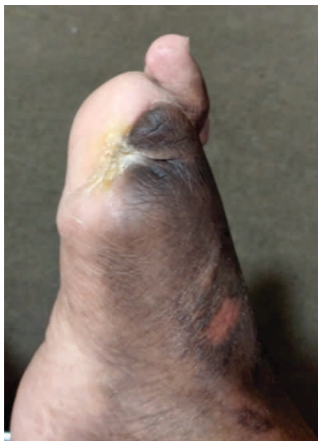
Figure 4. 1cm scar, no discharge, no edema, no surrounding erythema, plantar lesion completely resolved.

Likewise, improvement of the described ulcers was evidenced.