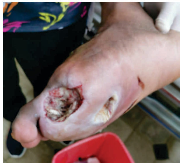
Figure 2. After surgical treatment, there is evidence of a 2 cm deep ulcerous bed communicating with an ulcer in the plantar region.