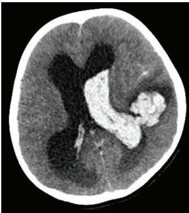
Figure 2. Multislice spiral tomography showing large left temporal intracerebral hemorrhage extending to the ventricle on the same side.